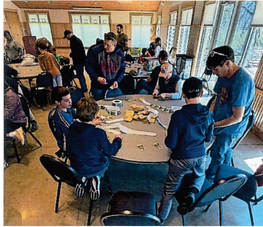
Scouts filling seed packets