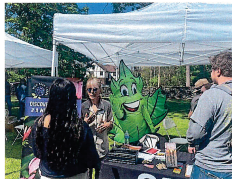
America 250 Celebration