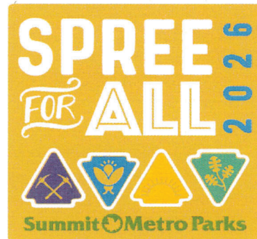
2026 Spree for All commemorative pin