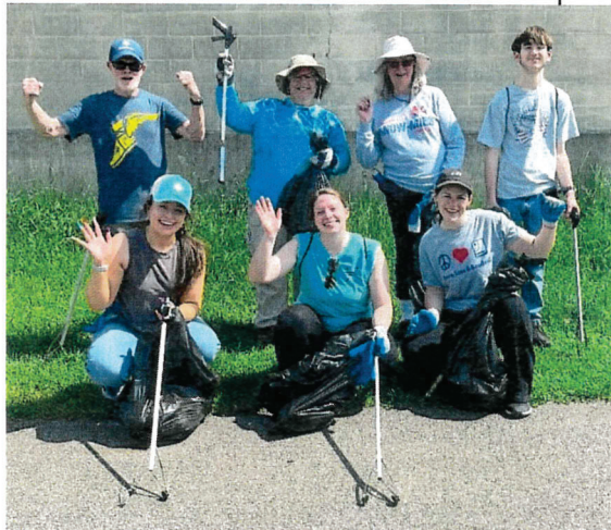
Photo: Freedom Trail Trash Clean Up