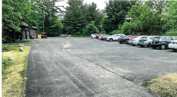
Completed Nature Realm service drive and employee parking