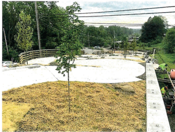
Switchback being installed on the west-end near bridge