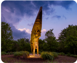
Bronze statue by Peter Jones at the Northern Terminus of the Portage Path