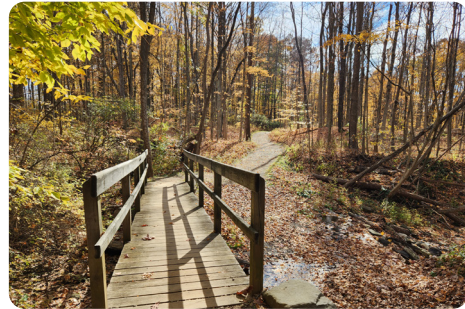
Old Mill Trail