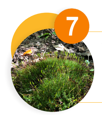
_____ MOSS: Throughout history, moss has played important roles for humans. Being very absorbent and antimicrobial, moss has been used as insulation for homes as well as wound dressings and even diapers!