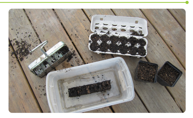
2. Prepare the potting soil: Wet the soil with water and knead like bread until the soil begins to clump together. Make sure you pack your containers to the top.

1. Gather your materials: You'll need potting soil, a container (an egg carton, leftover pots or a soil block maker), popsicle sticks, a marker and your seeds.