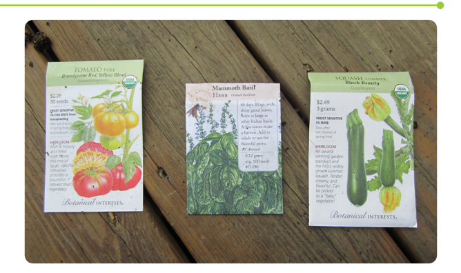
4. Select your seeds: Prolific growers that are appropriate for indoor starting include herbs, tomatoes, cucumbers, onions, lettuce and summer squashes.

3. Poke holes: Once your container is full, it is time for seeds. Create a hole for your seed (At least two times as deep as the width of the seed) using a pencil tip or your finger.