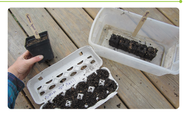
6. Label your containers: Write the type of vegetable and date planted on individual popsicle sticks.