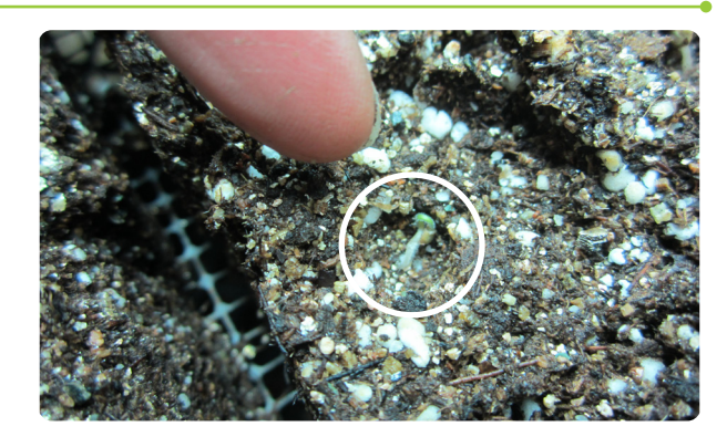
8. Keep moist and check in: Check on your seeds daily to make sure the moisture is adequate, and seeds have not yet started to germinate.

7. Store in a warm, dark place: Seeded trays need time, moisture and darkness to germinate. You can cover the trays with newspaper or plywood or store them in the basement until germination occurs.