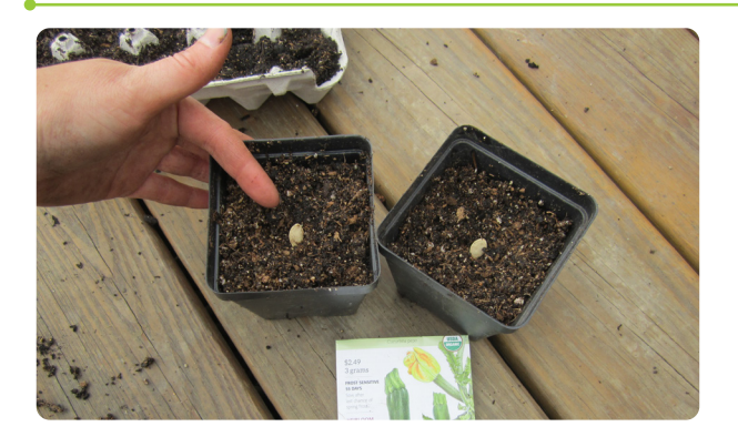
5. Sow your seeds: Place 1 to 2 seeds in each hole. Cover with a loose dusting of soil; we need oxygen to help our seeds germinate!